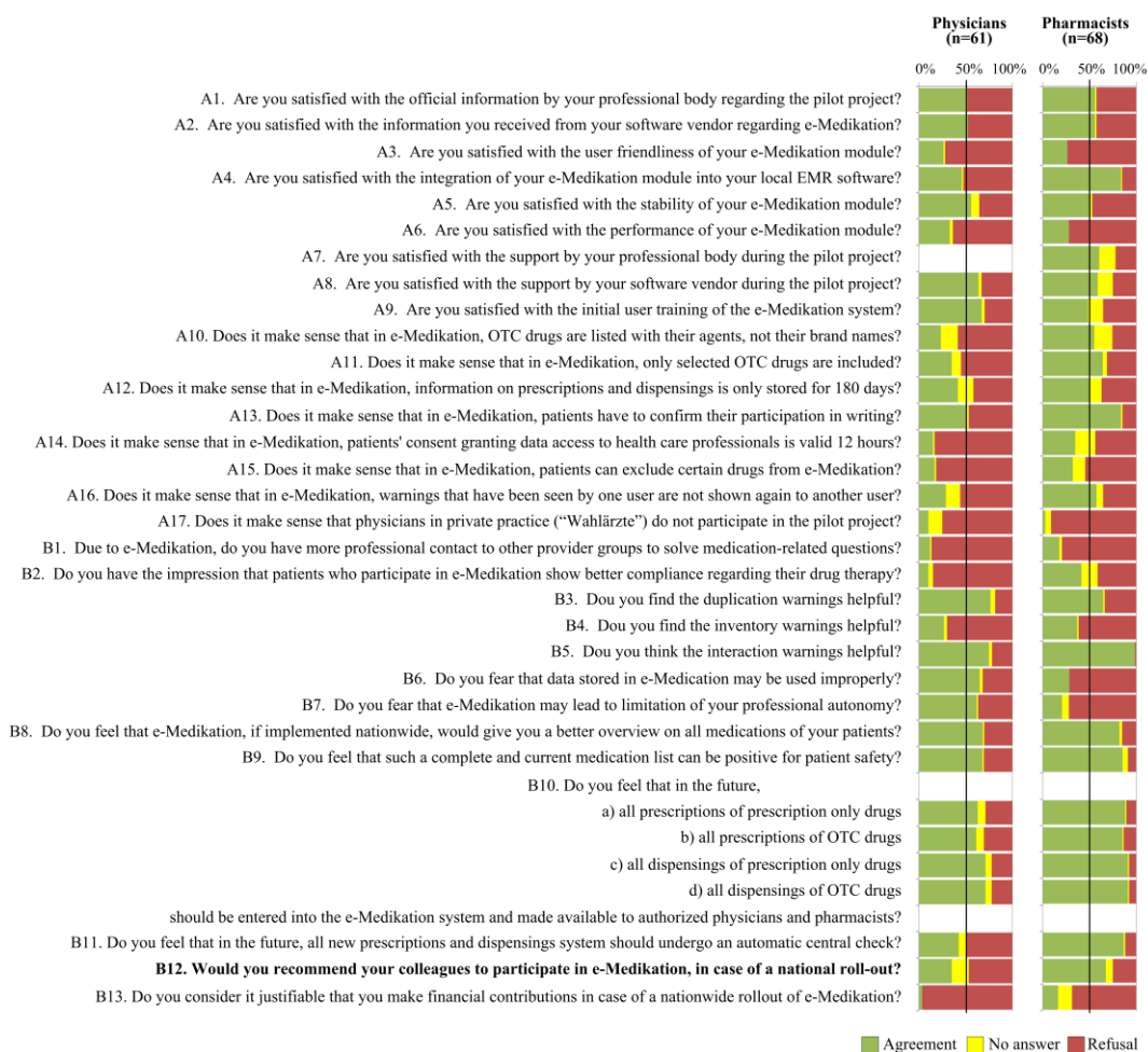
Fig. 1 Comparative overview on physicians' and pharmacists' responses to the 30 items.